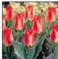
Figure 5: Plaisir

Order your bulbs early enough that they can spend anywhere from 8 to 10 weeks basking in the chill of your frig. Store them in a mesh bag so that they get good air circulation. If you are a fruit lover you may want to strongly consider getting a spare refrigerator – one of the minis so readily available. Fruit gives off ethylene gas – and ethylene gas will kill the flower inside your bulbs.