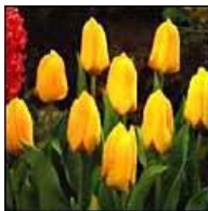
Figure 4: Candela