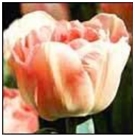
Figure 1: Angelique

Tulips are classified with perennials but often need to be treated as annuals. Dig up your tulip bulbs once the foliage has died & store them in a cool dry area for replanting in the fall. There are a wide variety of tulips, some are shown in the following figures.