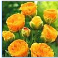
Figure 2: Beauty of Appeldoorn