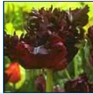
Figure 3: Black Parrot